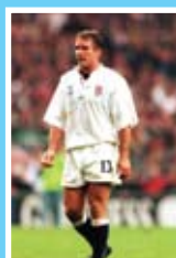
Phil de Glanville