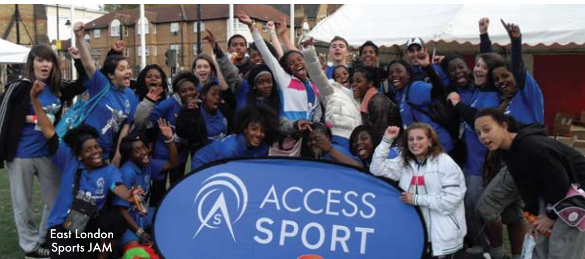
East London Sports JAM