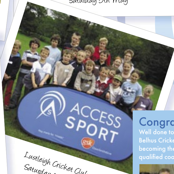
Lustleigh Cricket Club Saturday 12th May