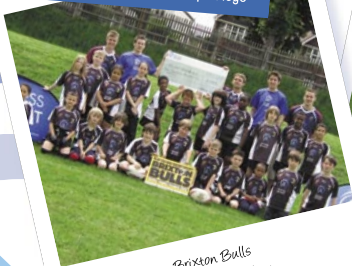
Brixton Bulls Sunday 20th May

28 boys and girls aged 6-11 attended Rosendale Playing Fields in Lambeth to take part in a variety of tag, touch and contact rugby league. We are loving their new kit proudly displaying the Access Sport logo