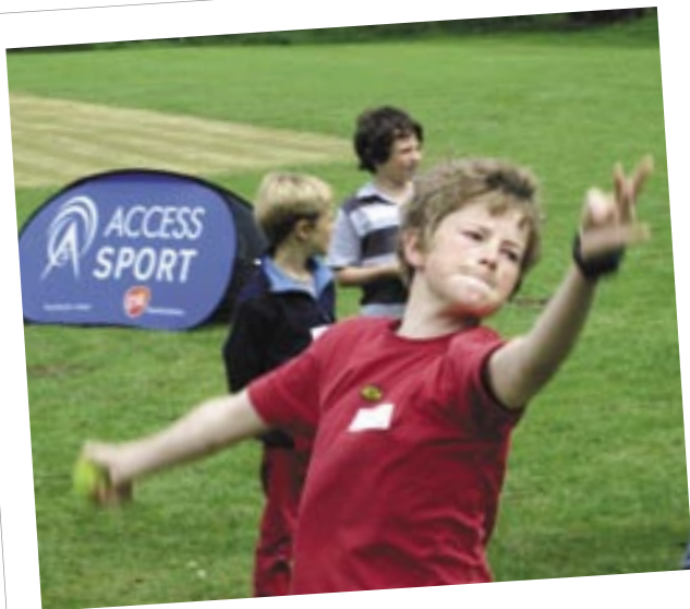
Lustleigh Cricket Club Saturday 12th May

The festival day saw youngsters getting active in a range of fun coaching sessions and games. There was lots of "high-fiving" and the day ended with an awesomely inspiring dunk competition between the pros!