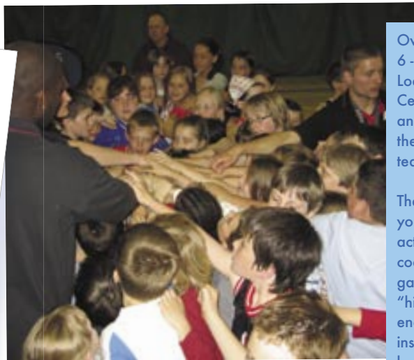
Reading Rockets Saturday 5th May

Over 80 children aged 6-11 attended Reading's Loddon Valley Leisure Centre to play basketball and meet the stars from the Rocket's professional team.