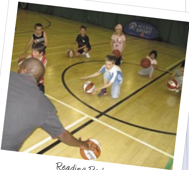
Reading Rockets Saturday 5th May

We are pleased to announce that we have started working with 26 NEW Partner Clubs since our last newsletter! We have created a junior section for Lustleigh Cricket Club and are currently busy confirming plans with the other new additions. Watch this space to find out more including our 15 Bristol clubs who are all really excited about their involvement in the Bristol City Festival of Sport.