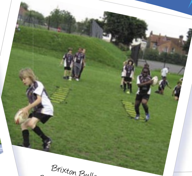
Brixton Bulls Sunday 20th May