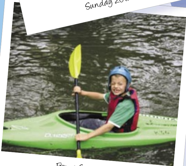
Frome Canoe Club Saturday 26th May